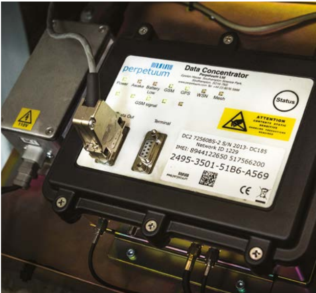
DATA CONCENTRATOR GATEWAY