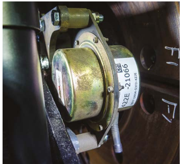
WIRELESS SENSOR NODE